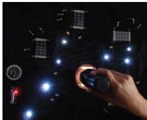
The textile that has eyes and blinks back to you