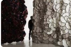
Clouds by Kvadrat

How to rethink interior decoration with textiles?