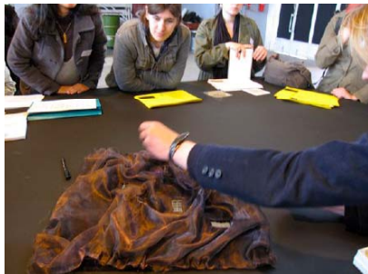
Workshop with architect, art and design students in Strasbourg