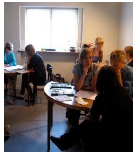
Workshop with textile design students at the Danish Design School