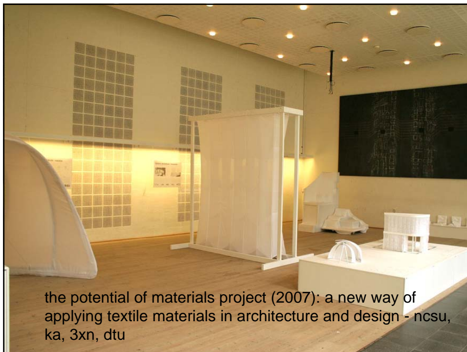
the potential of materials project (2007): a new way of applying textile materials in architecture and design - ncsu, ka, 3xn, dtu