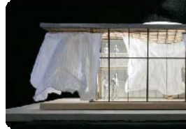
Soft House by Sheila Kennedy

How to create flexible housing with textiles?