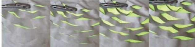
The textile that can move