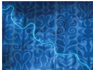
The textile you can talk to